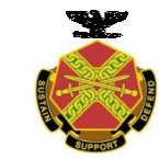
U.S. Army Garrison Fort Buchanan