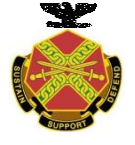
U.S. Army Garrison Fort Hunter-Liggett